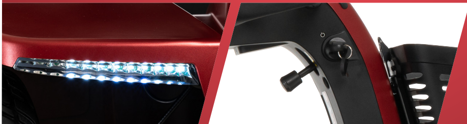
Full LED light package